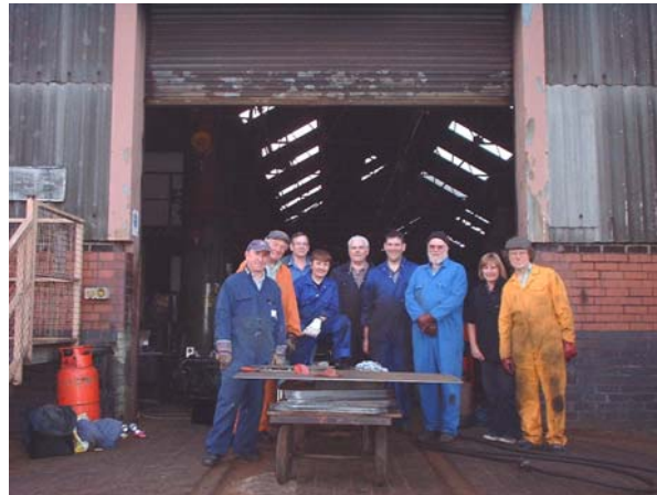
Members of the Thursday night volunteer group at Tyseley

Tyseley Locomotive Works Visitor Centre is open on public event days only.