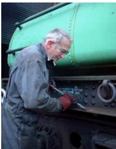
Above and top right: Volunteers undertake a variety of tasks at Tyseley and Stratford

The Society is an active supporters group that provides volunteer support assisting with events, restoration, stewarding on trains and fund raising. Indeed it would be impossible to operate the trains without this dedicated band of volunteers.