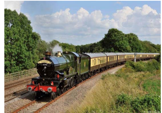
5043 Earl of Mount Edgumbe at Hatton

670 Warwick Road, Tyseley, Birmingham B11 2HL